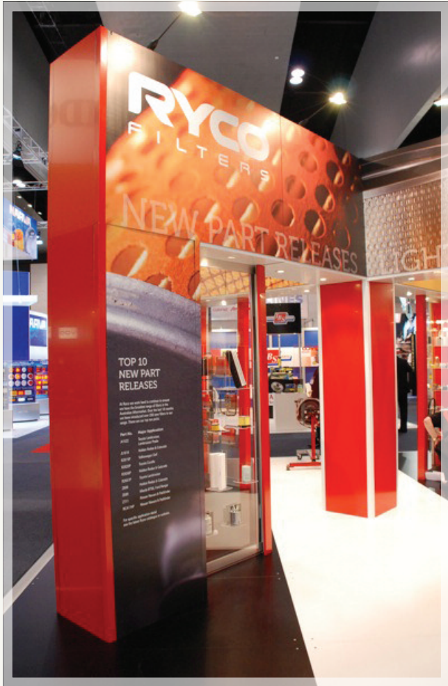
RYCO AUTOMOTIVE FILTERS