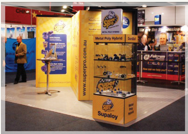
SUPALOY AUTOMOTIVE PARTS