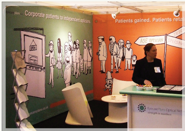
THE ASE OPTRAFAIR STAND