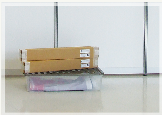
TWO BOXES OF SHELL-CLAD FIXINGS AND ONE FOR THE FABRIC GRAPHICS